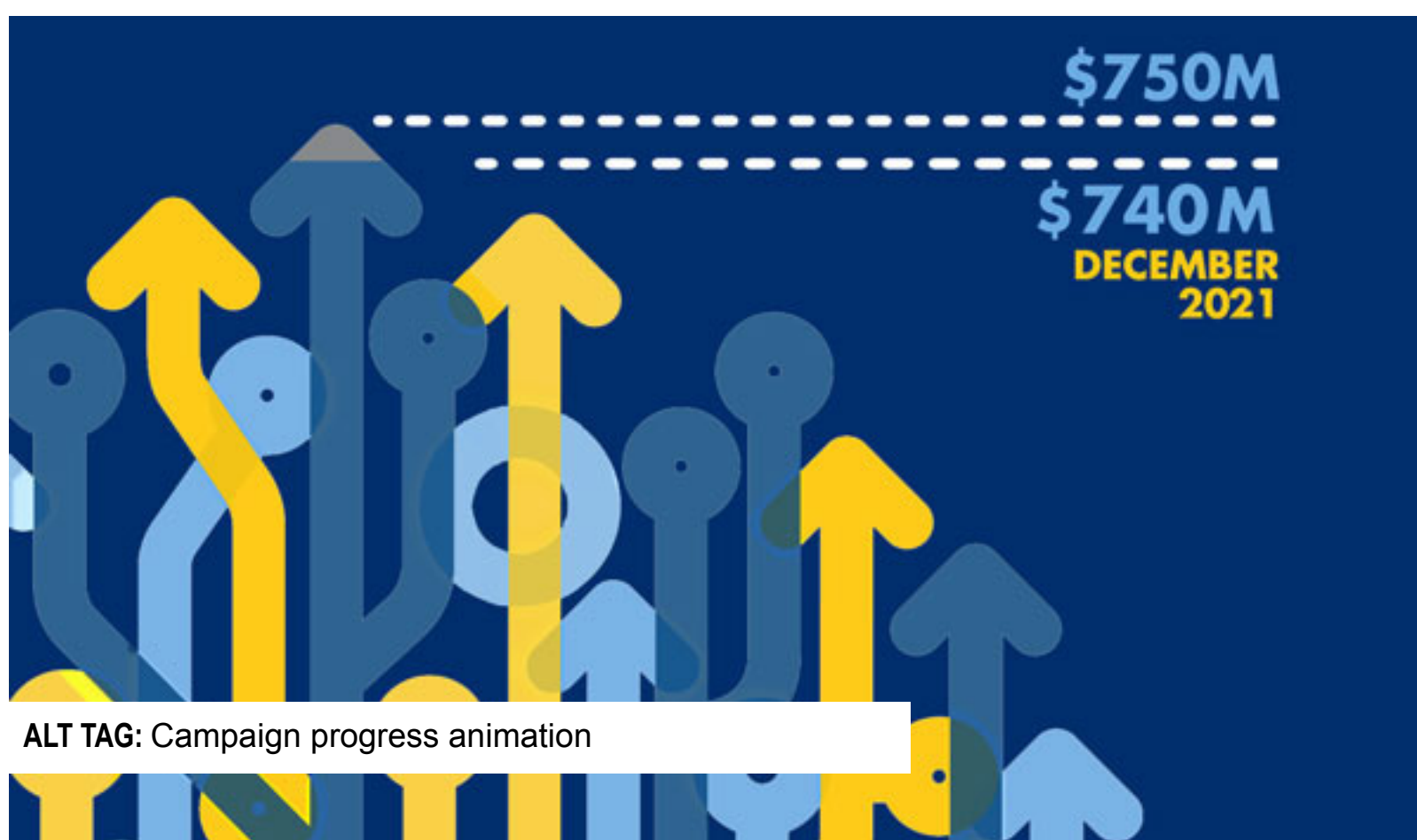
ALT TAG: Campaign progress animation

This season of giving, Drexel University celebrates the extraordinary commitment of alumni, friends, faculty and staff, like you, who have helped The Campaign for Drexel reach a remarkable milestone. Your impact is profound — propelling the aspirations of our students and securing Drexel's future as an innovative leader in higher education. With six months and less than $15 million needed to meet our historic goal, your continued partnership can create more opportunities and change more lives. Join us as we cross this historic finish line.