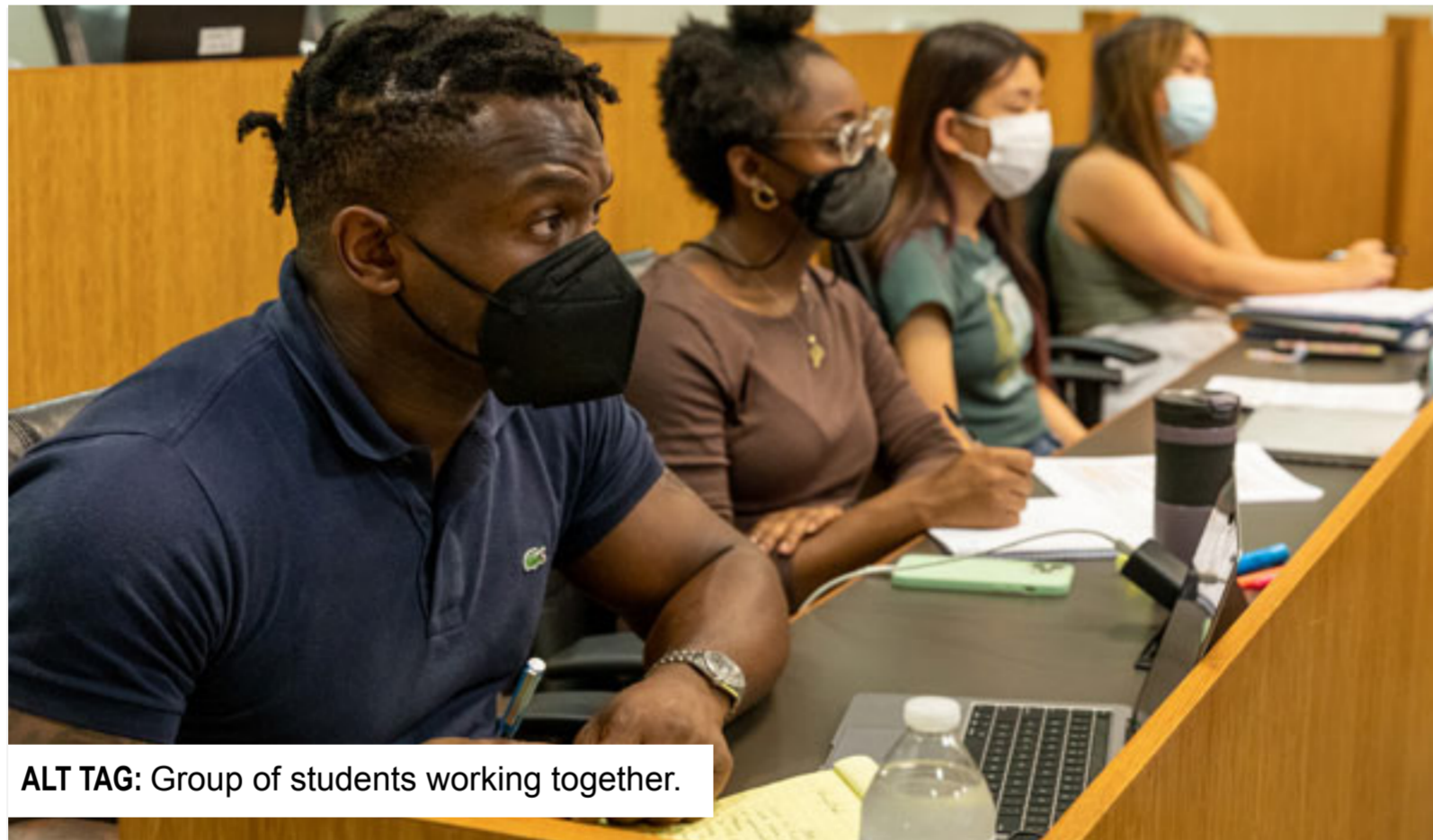
ALT TAG: Group of students working together.